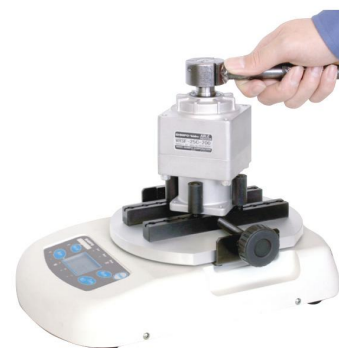
TNP Digital Torque Meter